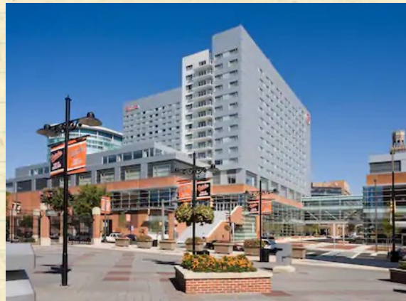
Hilton Baltimore Inner Harbor 401 West Pratt Street Baltimore, MD 21201

RESERVATIONS ARE REQUIRED FOR THE LUNCHEON.