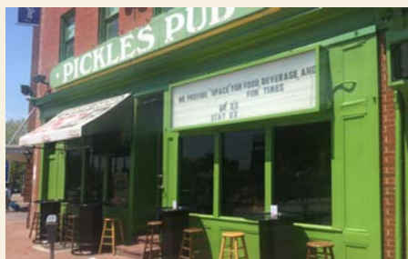
Pickles Pub 520 Washington Blvd