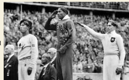
Jesse Owens, Berlin Olympics